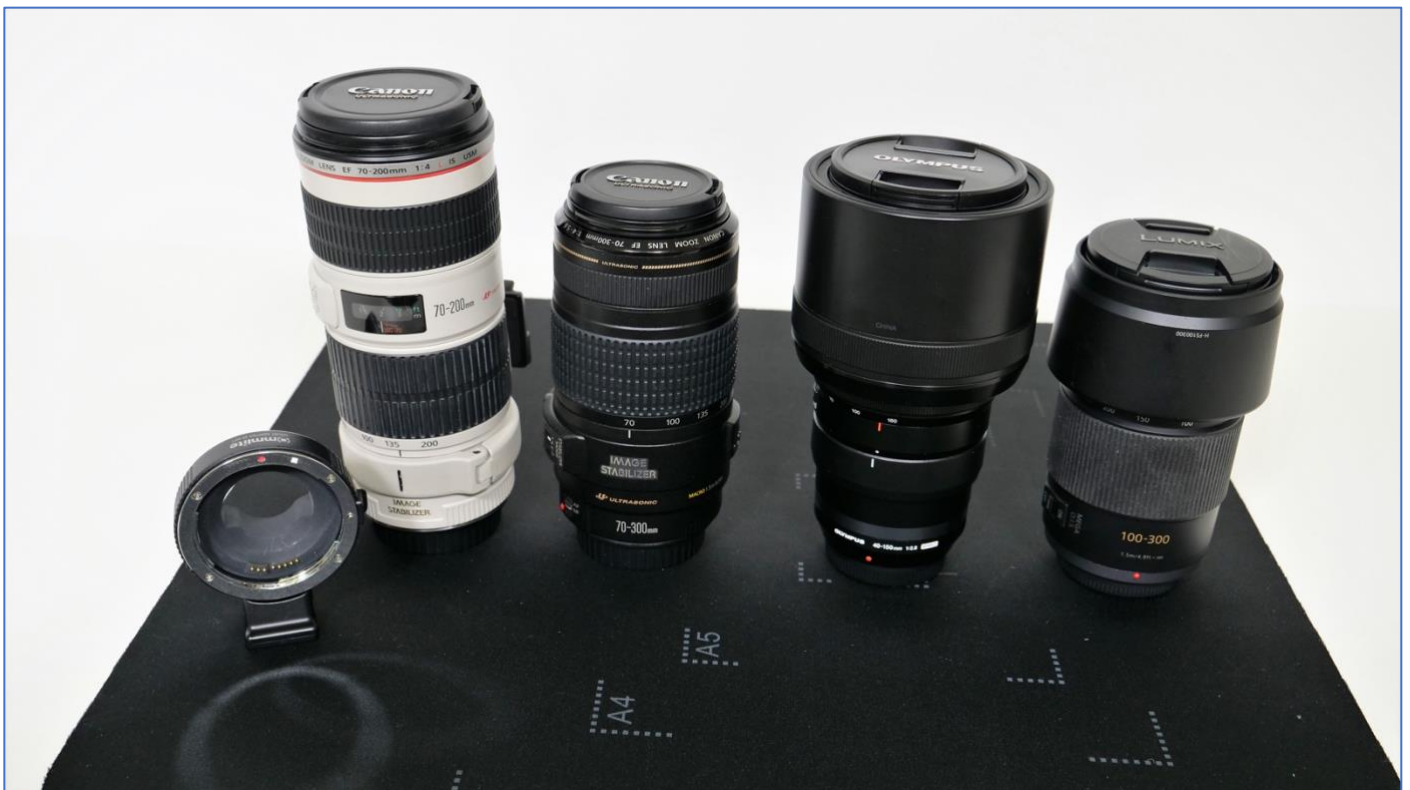
Lenses which I regularly use on Micro Four Thirds Cameras – including “adapted” Canon Lenses. 70-200mm L F4 IS USM & 70-300mm F4-5.6 IS USM from Canon. The 40-150mm F2.8 Olympus Pro and the 100-300mm F4-5.6 Panasonic Lens

The other M4/3 lenses that I have that cover all, or part of this range, are the 14-140mm and the 100-300mm Panasonic Lumix lenses. I do have the Canon 70-200mm L grade IS USM lens and the 70-300mm IS USM lenses which I can use on the M4/3 bodies by using an “active” adaptor which allows full control of the lens aperture.