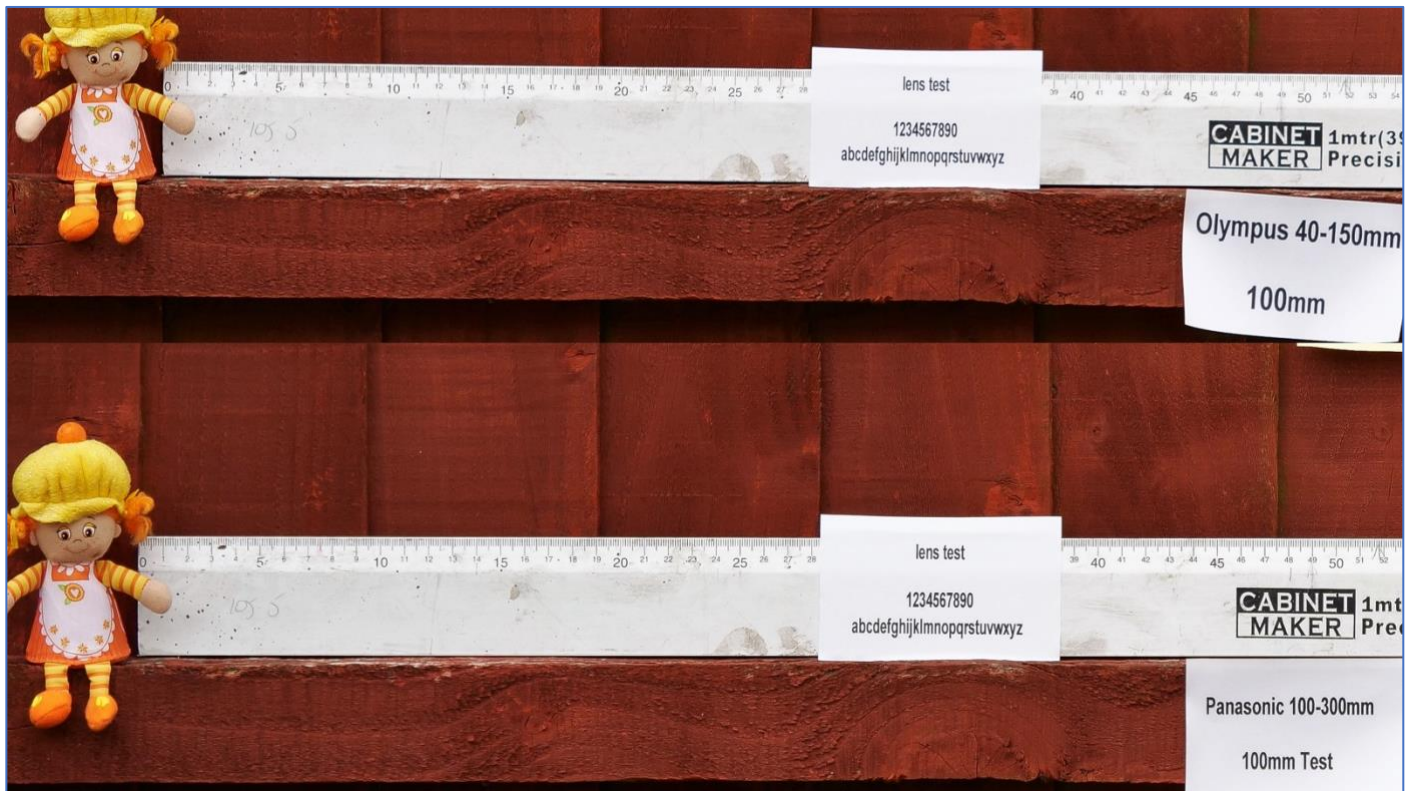
Enlarged section of the two lenses at F4 showing both lenses have equal resolving power at the edges.

At the wide-open apertures, where you expect the “pro” lens to be better optimised, I was slightly disappointed to find that it did not perform vastly different to the Panasonic consumer lens.