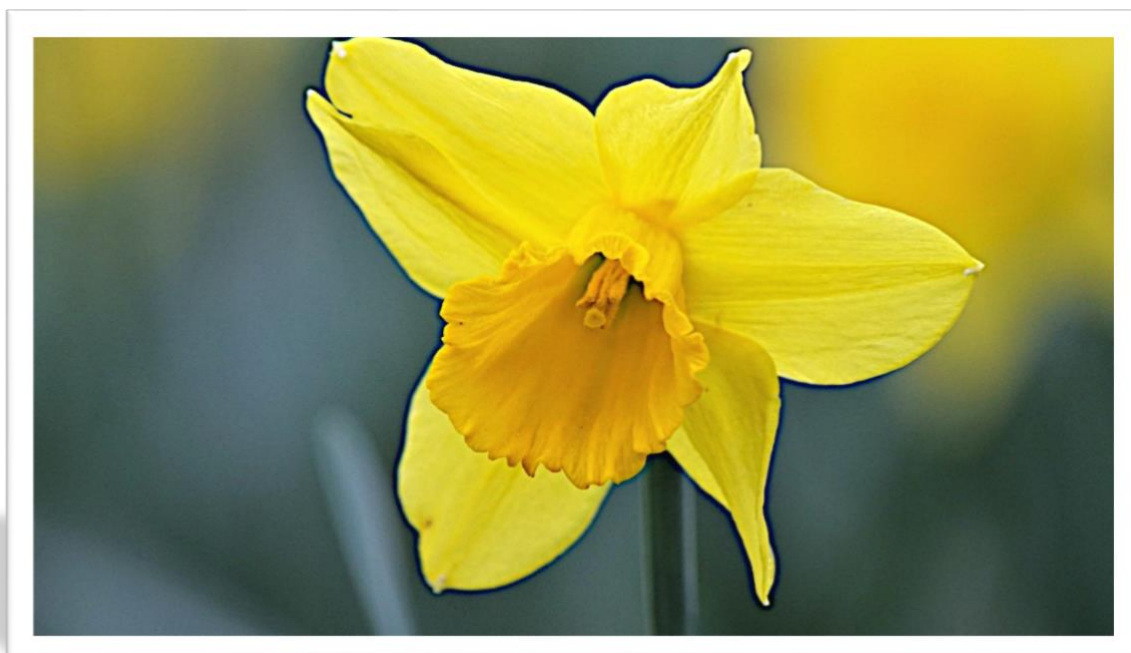
An example of the image quality with the Canon 70-300mm adapted lens of the Panasonic G9

So apart from much better physical construction and fully weatherproofed the "PRO" lenses don't appear to add that extra "bite" that I was expecting these lenses to deliver. Had the Panasonic lens had better manual focus and had a tripod mount ring then it would have been a lens that I could have truly recommended – especially for those who need that extra image quality for their wildlife pictures.