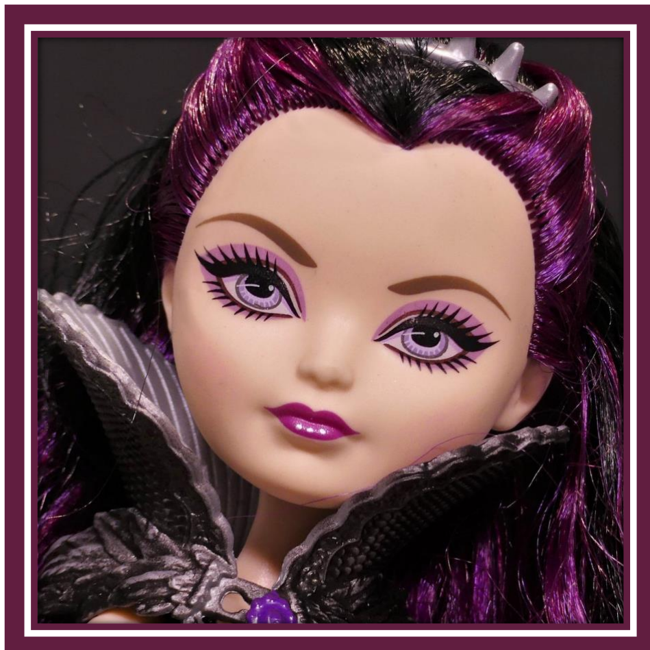
FZ330 - F4 ISO 100 -2/3EV

So, by using exposure compensation, normally applied for shots taken in Aperture or Shutter priority modes, you can get the perfect exposure irrespective of the background brightness. The real beauty of digital cameras is the fact that you can preview the result even before the image is captured.