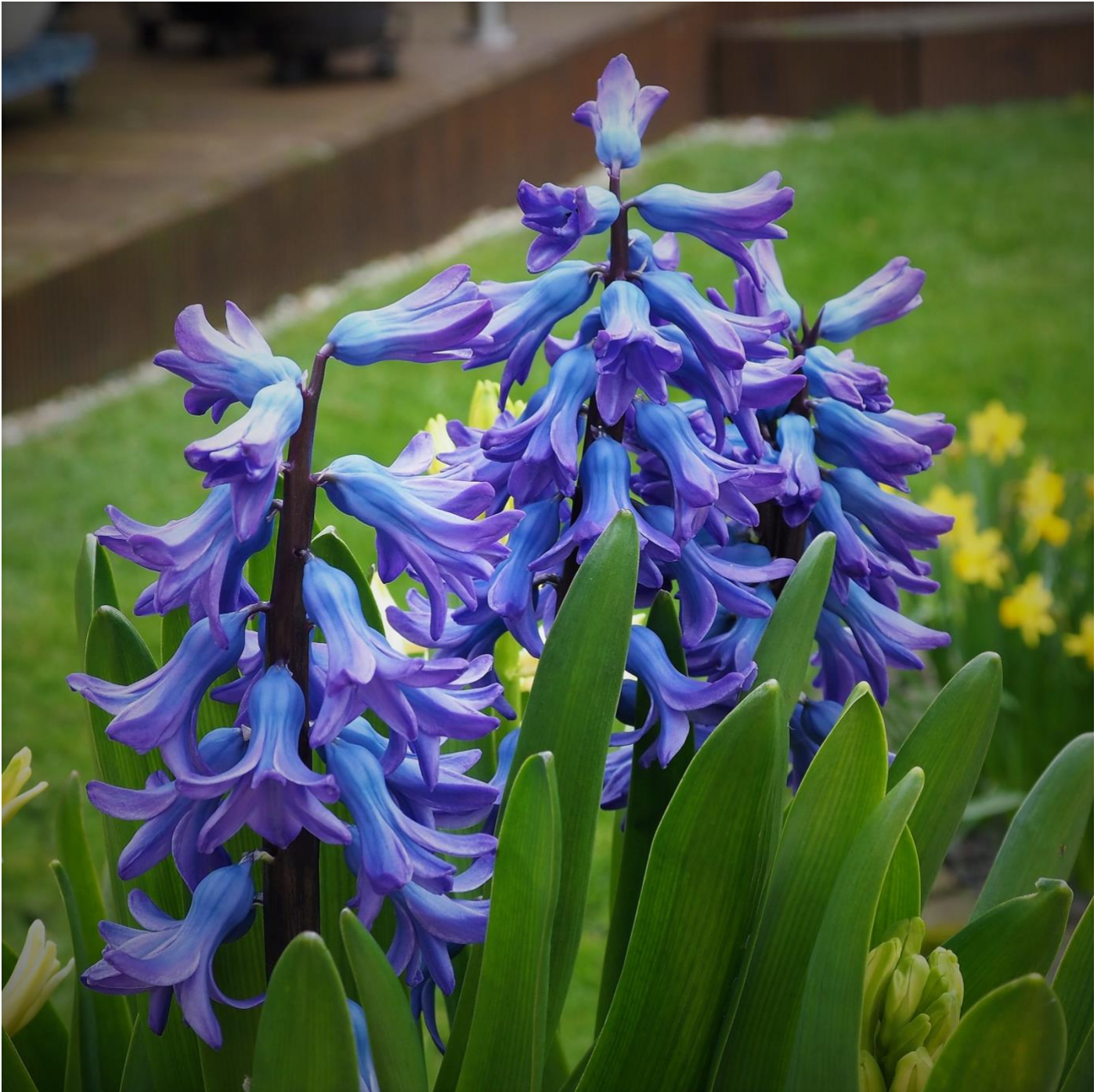
A FZ2500 camera test after return from the repair agents, lovely rendering of the blue hues.

I subsequently tested the camera in video mode and verified that it all worked well.