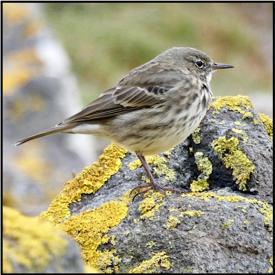
at 1200mm EFL