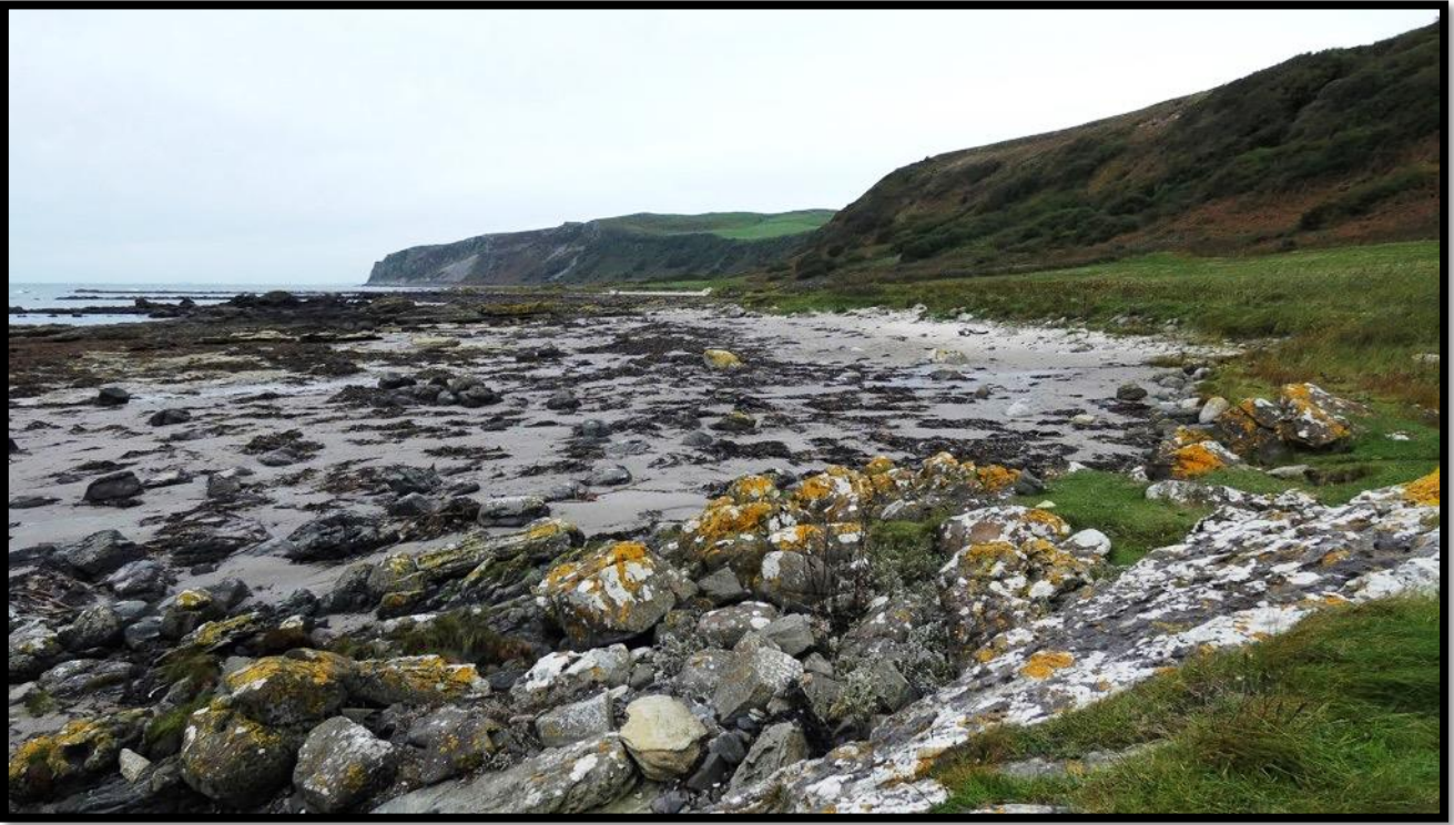
At 20mm EFL