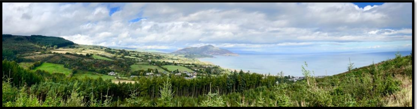
A panoramic view of the Holy island from the hills above Whiting bay.

Arran is described as 'Scotland in miniature' as it has all the elements of mainland Scotland packed into it.