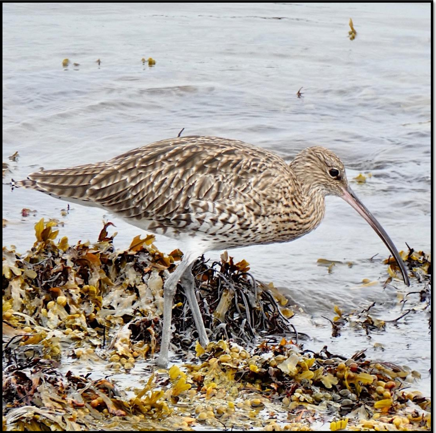
at 1200mm EFL

Because of this long focal length the effective aperture at the 1200mm position becomes F5.9 which does present the user with a few potential problems when shooting either stills or video.