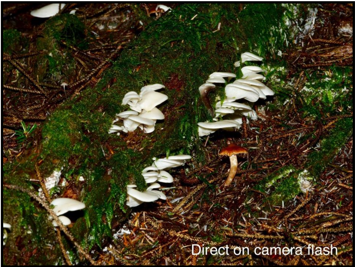
As you can see here the on camera mounted flash produced quite unpleasant results with strong shadows.