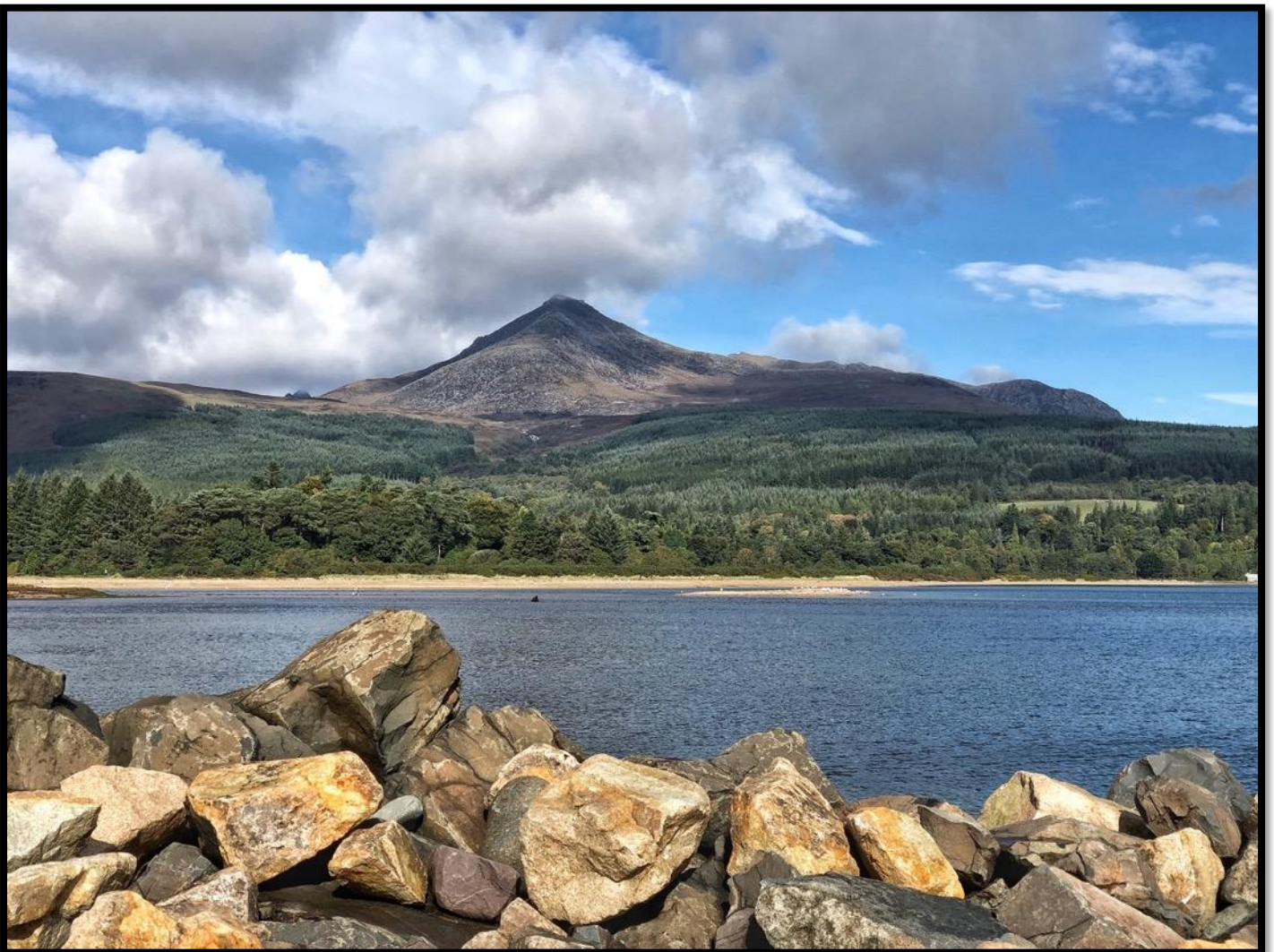
Goat fell clears from the clouds just as I prepare to leave!

Still it will be good to get back home and edit some of the images and video and of course see my family again.