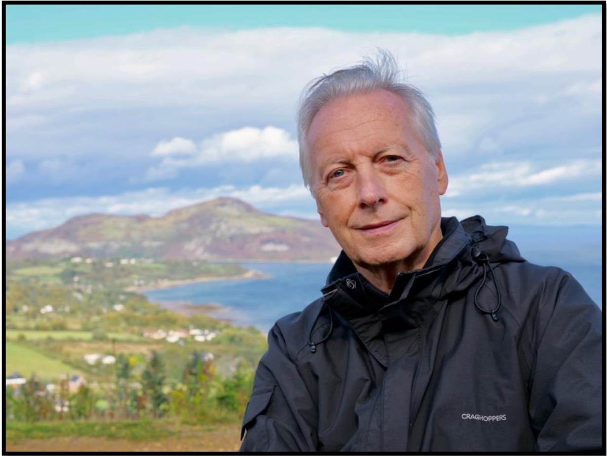
A great place to sit and soak up the views. Worth £1m of anyone's money!