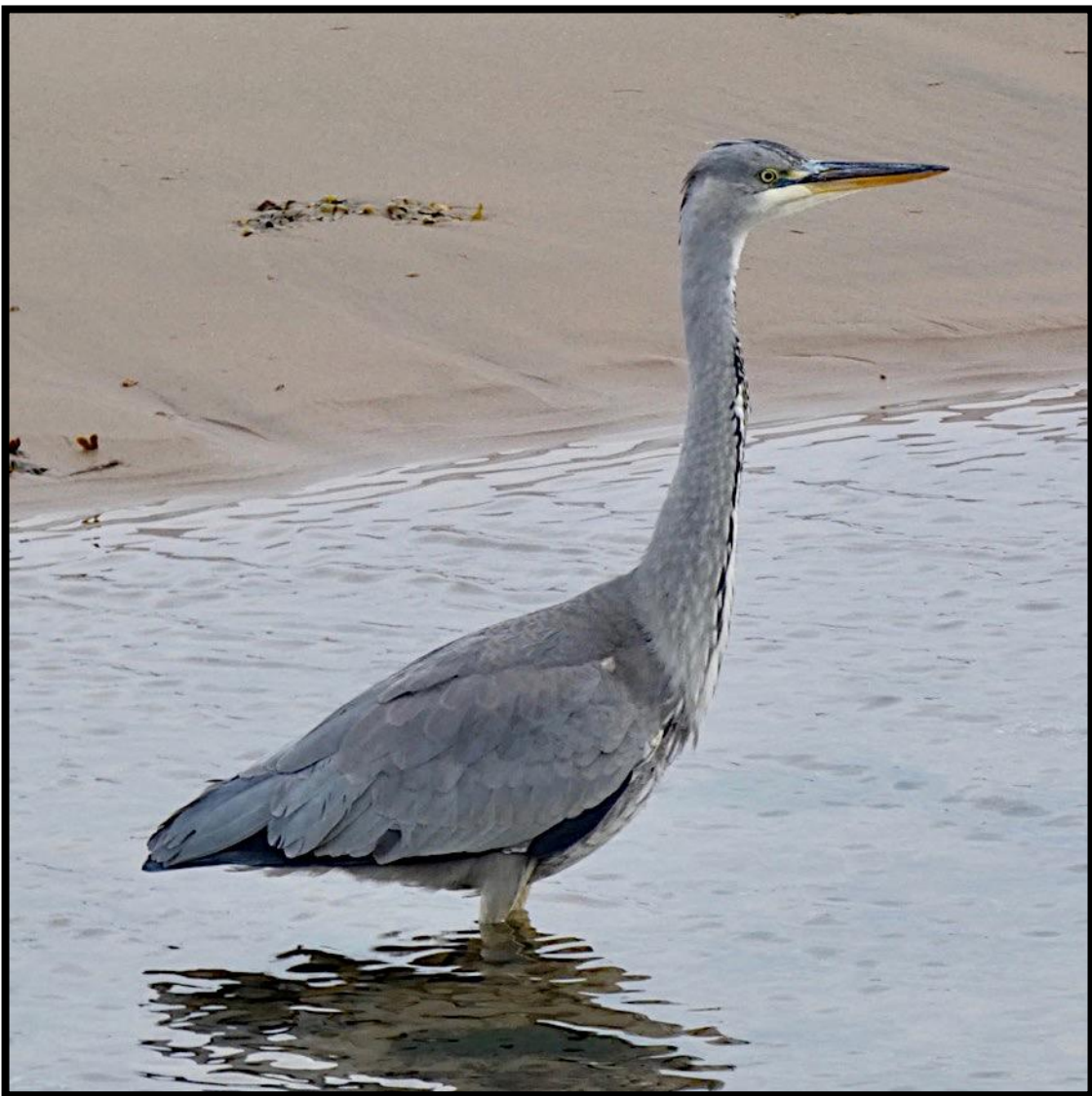
At 1200mm EFL