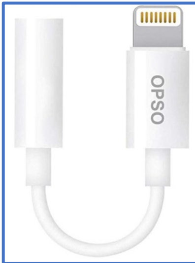
The Lightning to 3.5mm