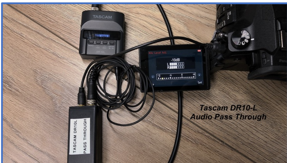
Method 2 showing the stereo channels active

The second method requires a little DIY construction/soldering to make it but it does have the advantage that the output to the camera has the audio paralled to both the left and right channel inputs.