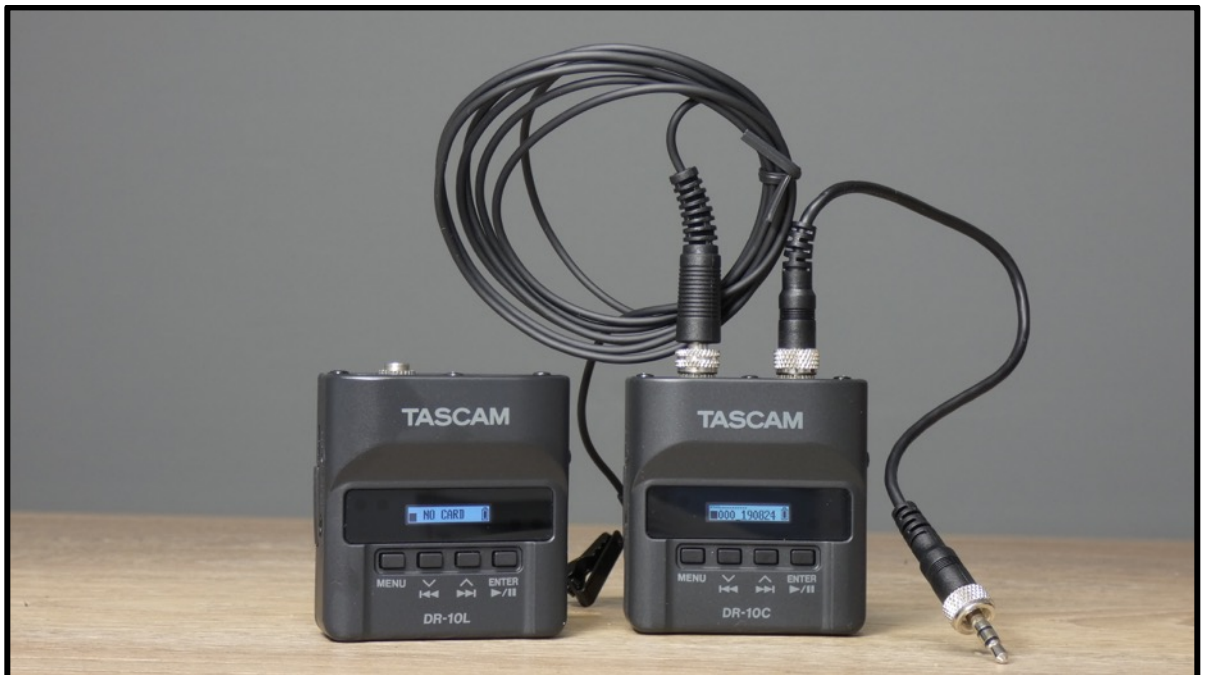
The Tascam DR-10L and DR-10C units

This means that you cannot record the identical track on this recorder at the same time as the track recorded on the camera. In the USA the DR-10L is supplied with a lavalier microphone whereas the DR-10C does not and you use the lavalier that is supplied with the wireless microphone that this unit is designed to partner. With this mini recorder between the microphone and the transmitter it means that any wireless RF drop outs are not a problem as the mini recorder is capturing an identical audio track as well as a safety track which is -6dB to the main track. This allows you to recover a section of audio if the audio reaches limiting levels.