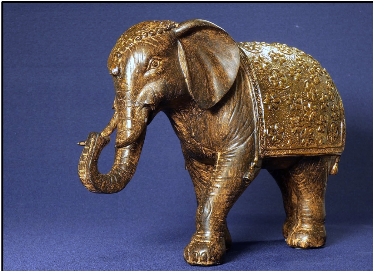
Close up image from the FZ80. ISO 80 @ F5.6

I had an “interesting” discussion with one subscriber during the week about the “terrible” quality that her FZ80 was producing and when trying to shoot closeups got nothing but error messages and out of focus images.