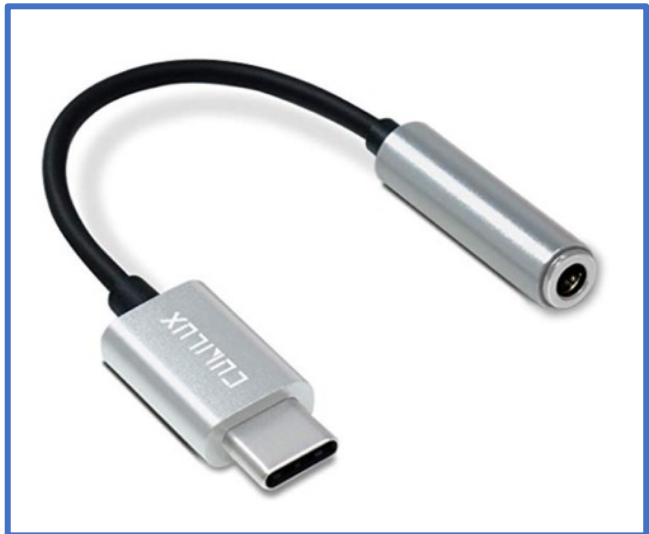
USB-C to 3.5mm

The choice of lavalier microphone can be quite a challenge to get one with the right plug configuration as there are both the TRS (the older standard) and the newer TRRS one. The TRS microphones generally will not work with these adaptors. They need a TRS to TRRS adaptor.