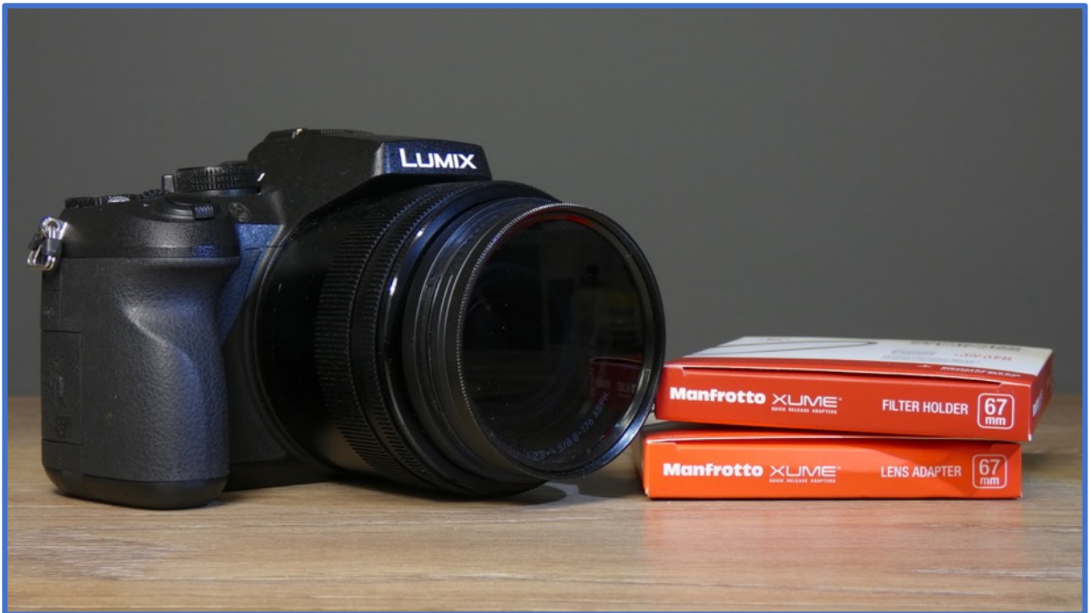
The Manfrotto Xume System – Lens adaptor and Filter adaptor system

I haven't checked on compatibility between the two systems – I have a 72mm filter adaptor on order to test it. The Xume system also retails for a considerable amount less. Here in the UK the lens adaptor for 67mm was £26 and the filter adaptor £11.