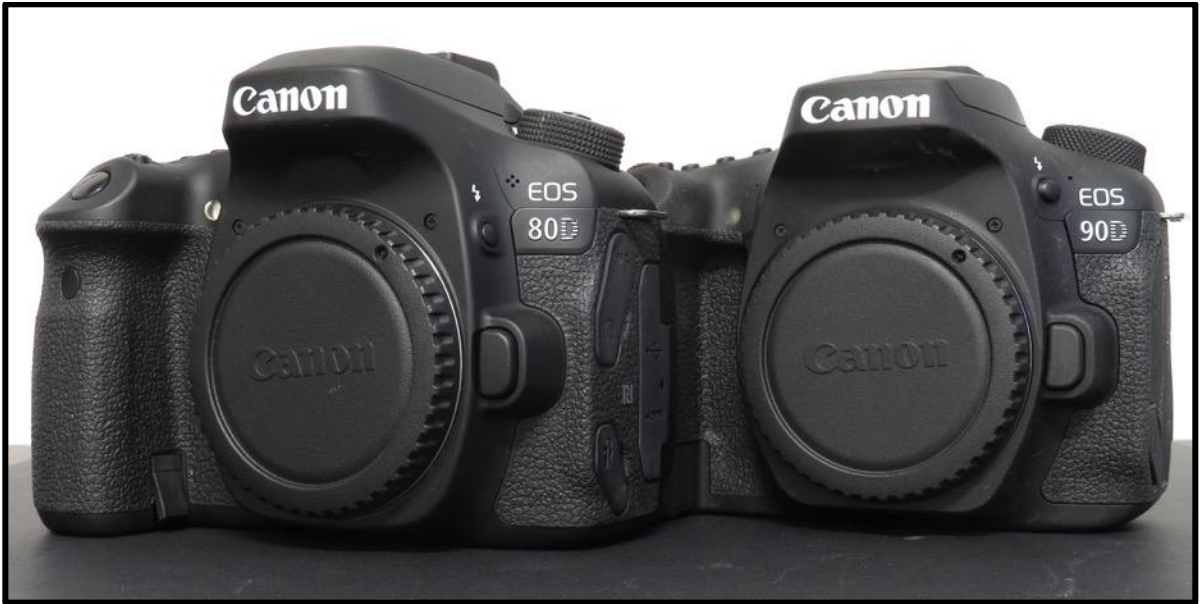
The Canon 80D and 90D camera with 24 and 32M pixel sensors