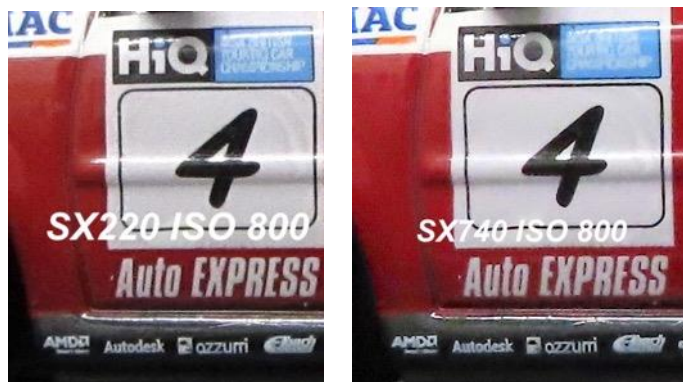
Enlarged crops at ISO 800

Shooting at the optimum F4 aperture the results are almost identical at ISO 100. When you switch to a higher ISO it looks like the SX740 with the 20M sensor has cleaner areas of image data in the lighter areas of the image, however in the shadows there is a lot of evidence of some heavy noise reduction with reduced image sharpness. (selective image processing?)