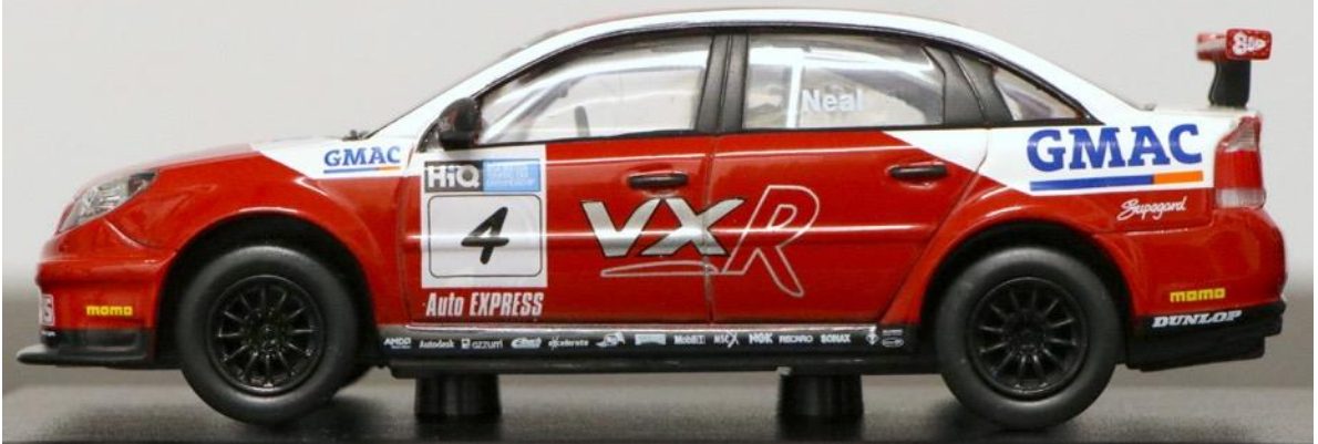
Canon 90D ISO 3200