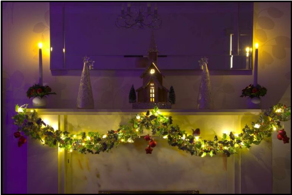
In contrast this shot was taken with the ambient lights off with only the Christmas tree lights on

It's a matter of personal preference but the shot with the room light on paints more light to reveal the form and structure of the display and doesn't take on the hot spots of light from each of the lights in the garland.