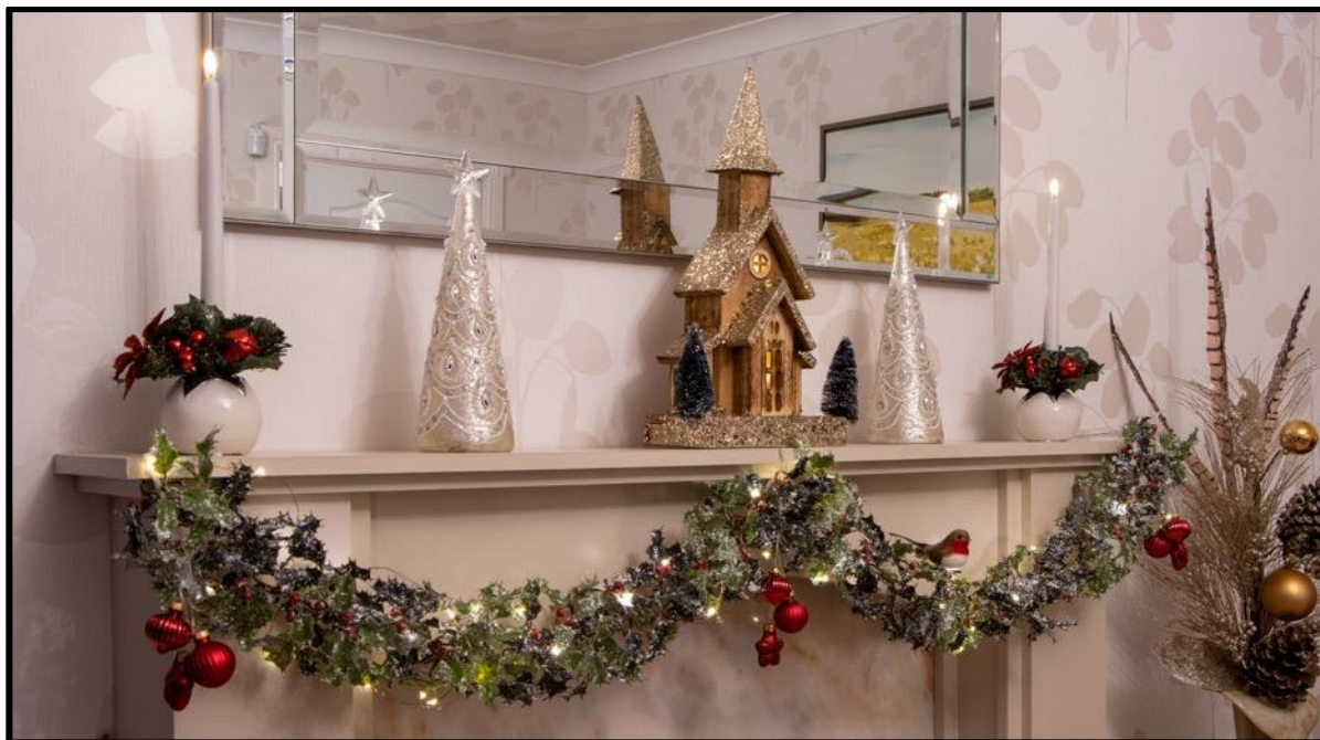
Here I chose to use the ambient lights to capture the whole of this display

If you focus on a single decoration you can use the room ambient to add the lighting to sculpture the shape.