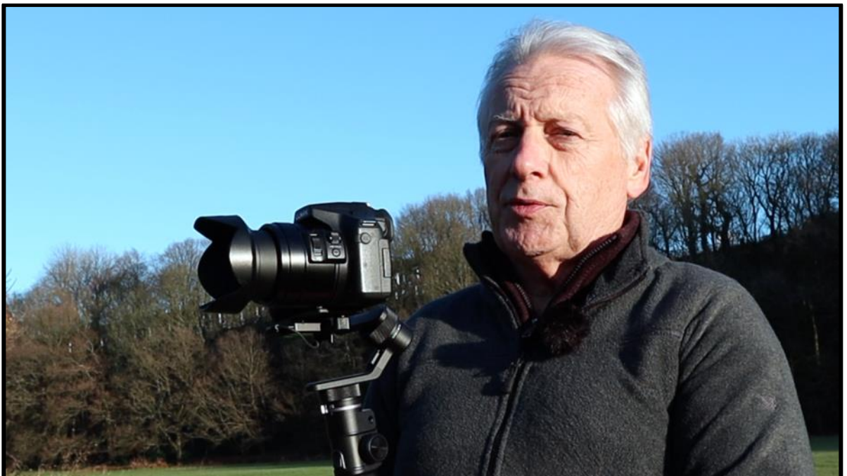
The Panasonic Lumix FZ3003/330 on the FeiyuTech G6Max Gimbal.

The biggest compatibility and full utilisation of all the functions of the Feiyu On app is to use a smartphone mounted using the smartphone mount. You can then perform time lapse stills, face tracking, object tracking, motion tracking and capture time lapse motion video.