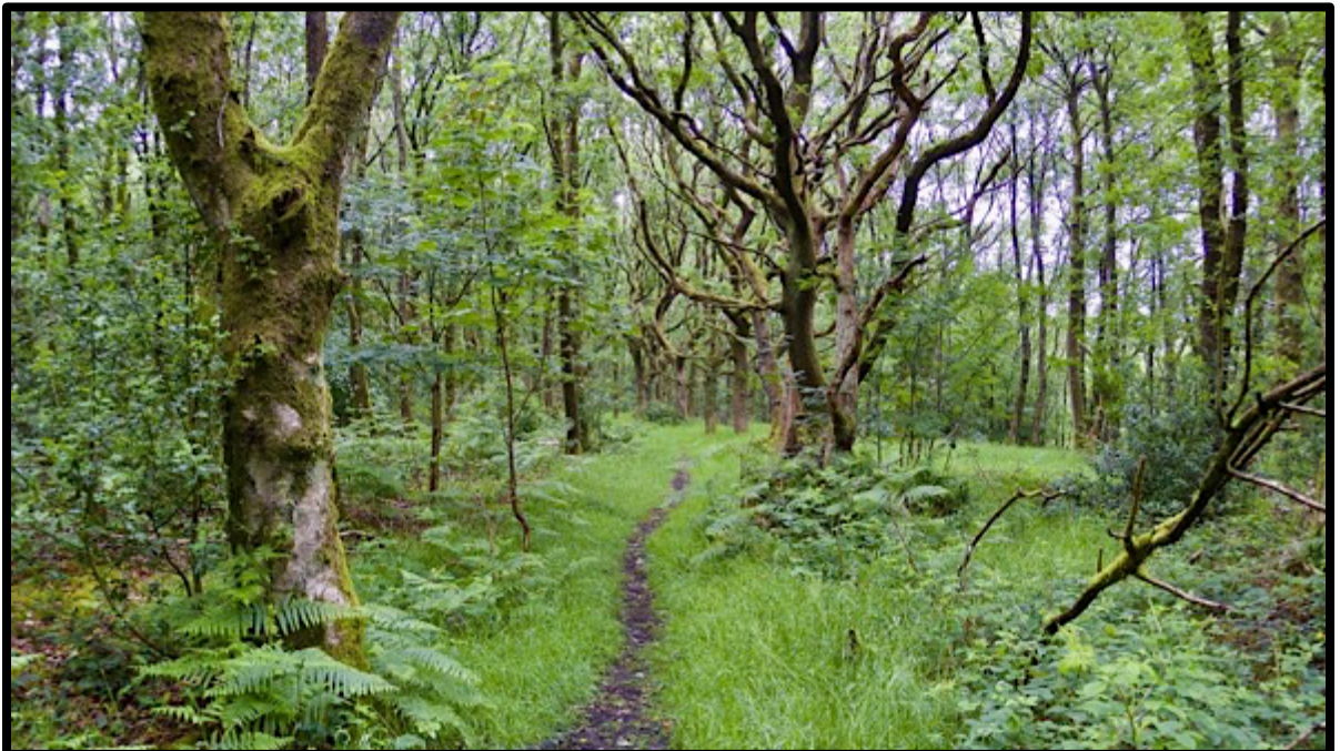
Enchanted forest walk

It's a real pity that Ricoh decided to end development and production of this range of cameras. Add a convertor tube and it can be used with all kinds of legacy glassware. With a 5X crop factor it can give some very big focal length equivalent images. Providing you use a