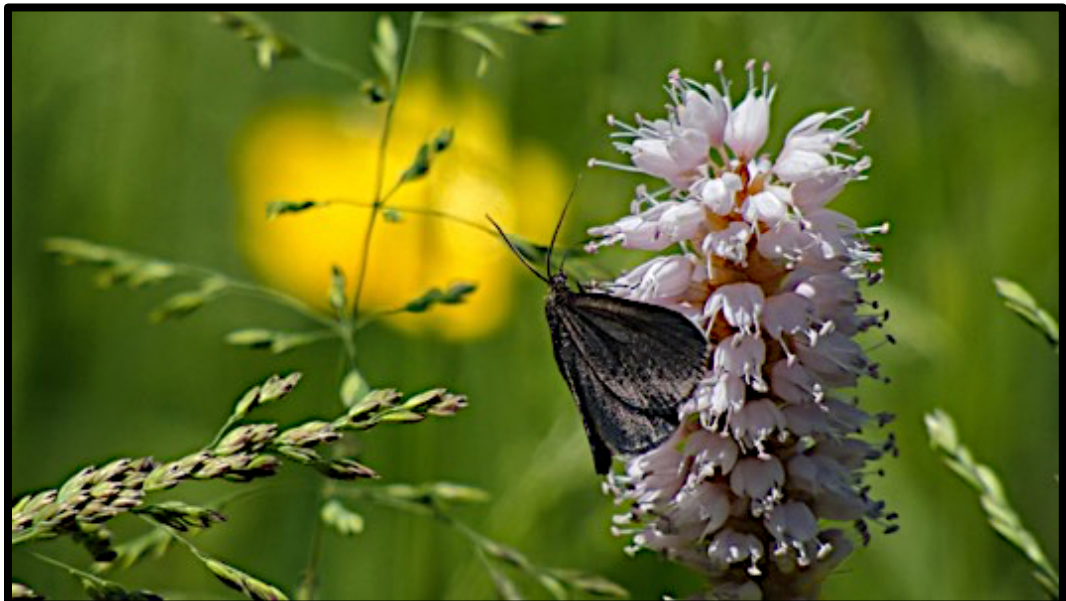
An image from the video

In this particular video I show what image quality you can achieve with this camera provided that you stay within the ISO 80-125 range and keep the zoom setting below 900mm EFL.