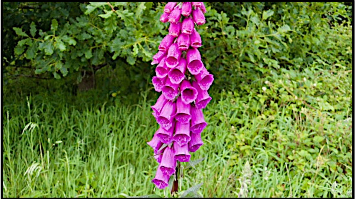
Foxgloves with the Q7 and standard zoom lens.

It's not perfect (nor is the iPhone portrait implementation) but does show the level of intelligence built into the camera.